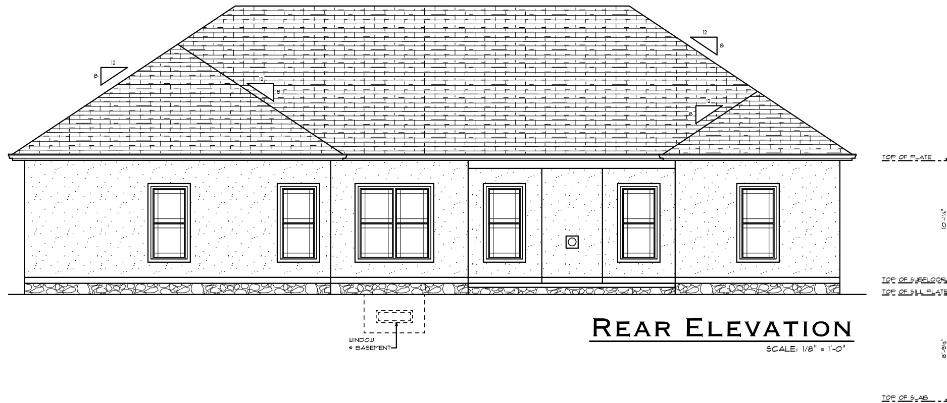
REAR ELEVATION SCALE: 1/8" = 1'-0"